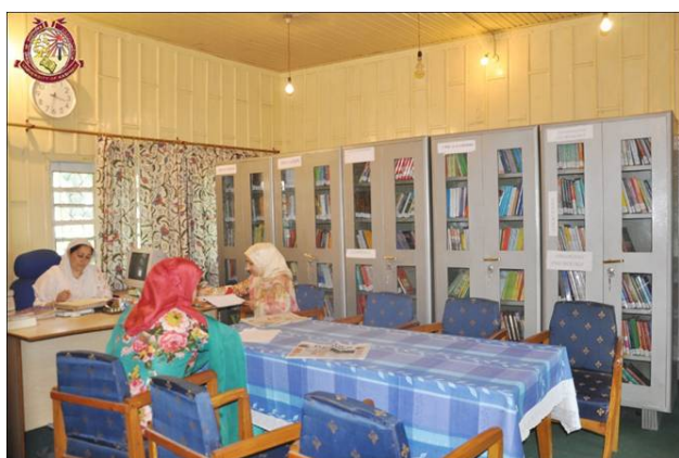
Library of UGC-HRDC, University of Kashmir

IT and e-waste management, e-resources and pervasive computing, academic mining, introductory and advanced features of MS-Office including MS-Word and MS-Excel. Resource persons were invited from NUEPA, New Delhi, Department of Computer Sciences, University of Kashmir, Directorate of Information Technology, University of Kashmir, Dept. of Computer Sciences, NIT, Srinagar and The Business School, University of Kashmir.