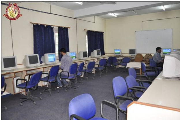
Computer Lab of the UGC-HRDC, University of Kashmir

In his address Director HRDC stated that our sole aim is to promote anytime learning, anywhere learning besides enhancing easy access to information in these times of IT explosion. Need of the hour is that that our