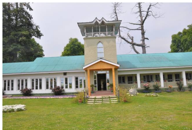
Zabarwan guest house of the University of Kashmir