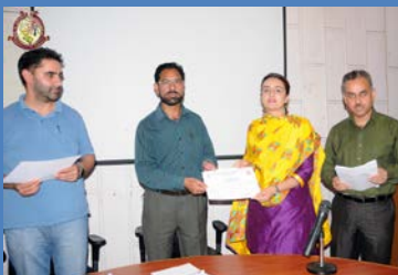
Certificate Distribution Function of a Short-Term Course in Information Technology