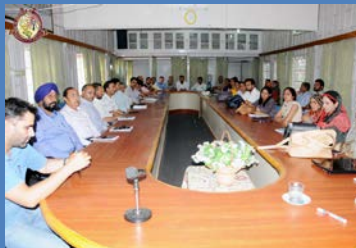
Technical Session of the short-term course in Information Technology