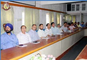
Participants of the short-term course in Information Technology attending a session