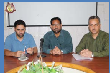
Valedictory Function of a Short-term Course in Information Technology