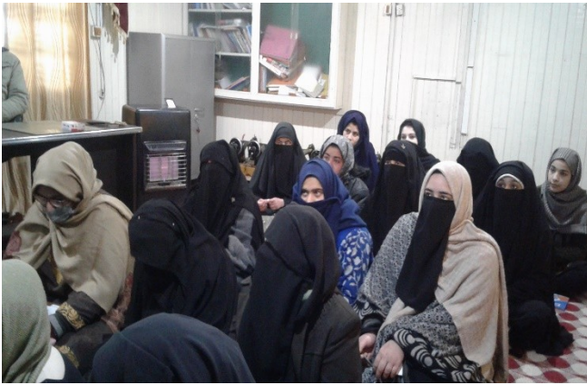
Bridal Mehandi Designing