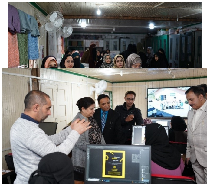
Self Employed Tailor