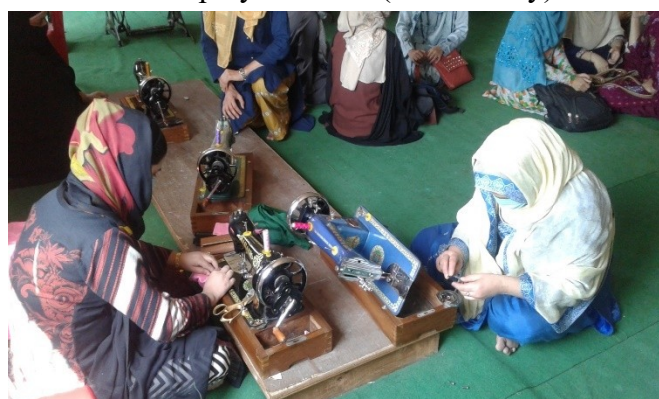
Self Employed Tailor (Community)