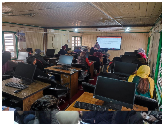
Basic Computer and Internet