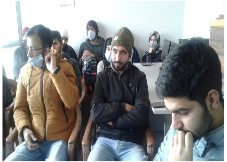
Auto CAD 2D+3D