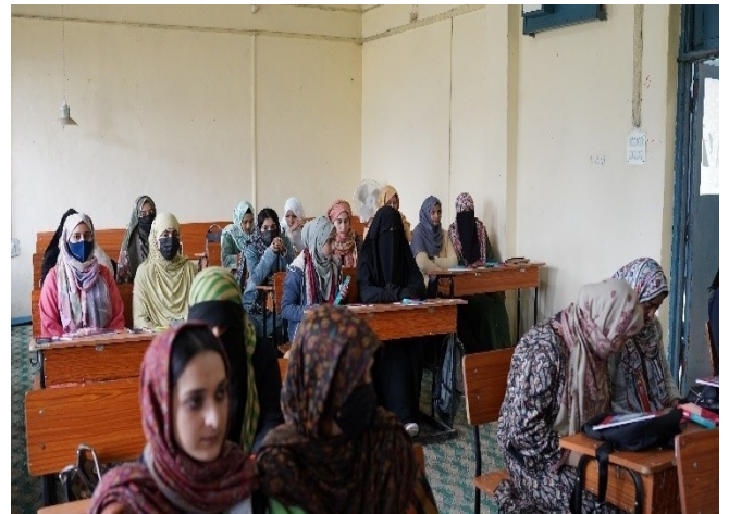
Cutting and Tailoring