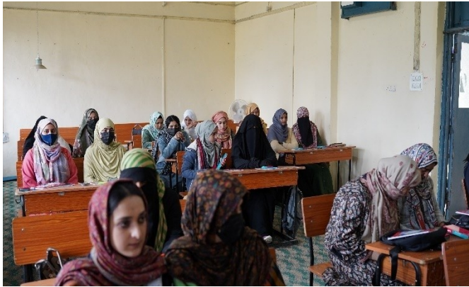
Self Employed Tailor