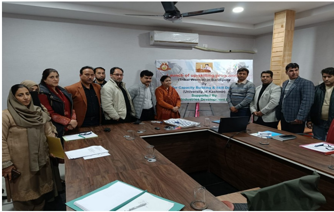
Online Inauguration of up skilling Centre by Hon VC. KU